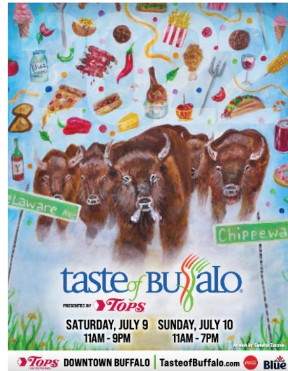
2022 WINNER Cameryn Zastrow