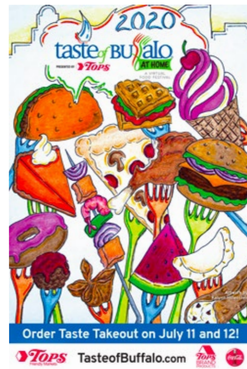
2020 WINNER Kelynn Holenstein

Submit your poster art online at TopsMarkets.com/TasteOfBuffalo or by mail.