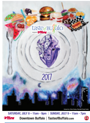
Final 2017 Poster