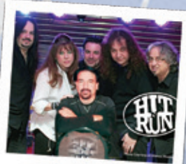
Hit n Run 6 pm - 8:30 pm