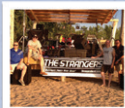
The Strangers 4 pm - 6:30 pm