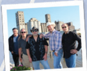
West of the Mark 12 pm - 2:30 pm