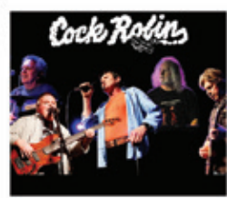
Cock Robin 9 pm - 10:45 pm