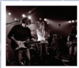
Ultraviolet 3 pm - 5:30 pm