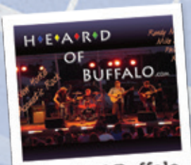
Heard of Buffalo 12 pm - 1:30 pm